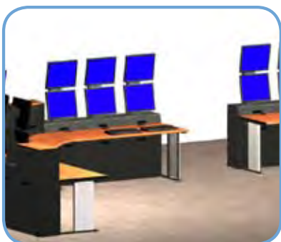
Configuration with display walls and flat monitor mounts

Developed for the process control industry, iTrac is a system predicated on welded frames or “cubes” that measure 12-inches deep to provide an exceptionally stable and rugged structural base. This cube design accepts integrated CPU storage and high-capacity cable management routing; add one or two levels of stackable display cubes for flat panel mounting to accept interface panels for annunciators or other rack-mount gear. iTrac is well suited for multiple operator use with the selection of spacious desktop surfaces and a variety of workstation designs that address room sightlines or to build around the perimeter of a control room.