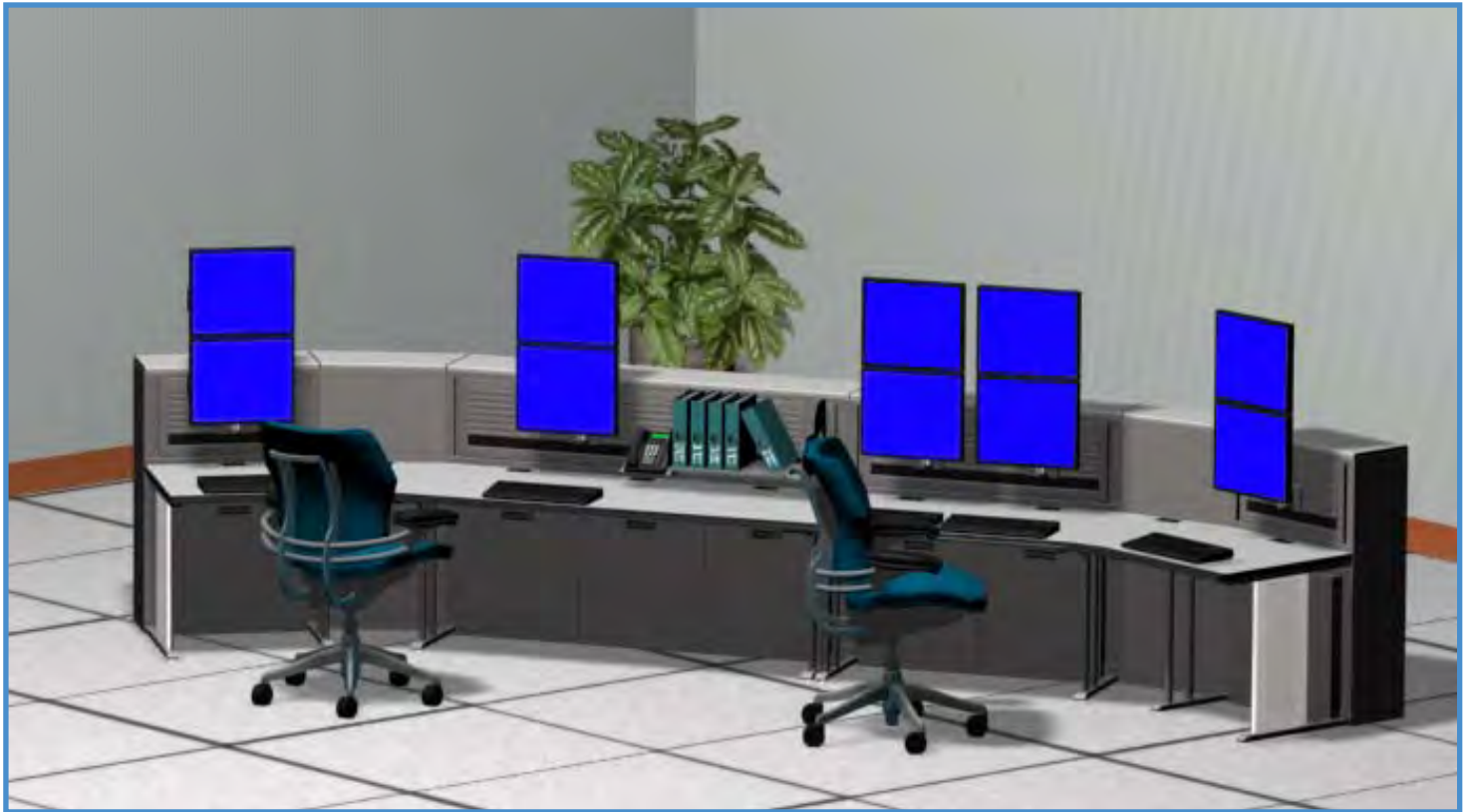
Single-tier configuration with stacked monitor arrangements