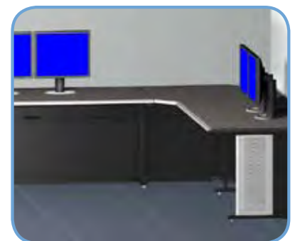
iTrac can also be configured as a desktop console with extra-deep worksurfaces