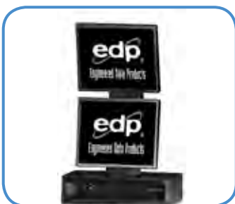
Monitor posts, exclusive to e-Systems Group, accepts one, two and even three levels of monitors without the use of a dedicated wall. Includes a keyboard garage for storage.