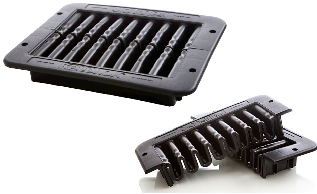
KoldLok® Wave™ 46-20100