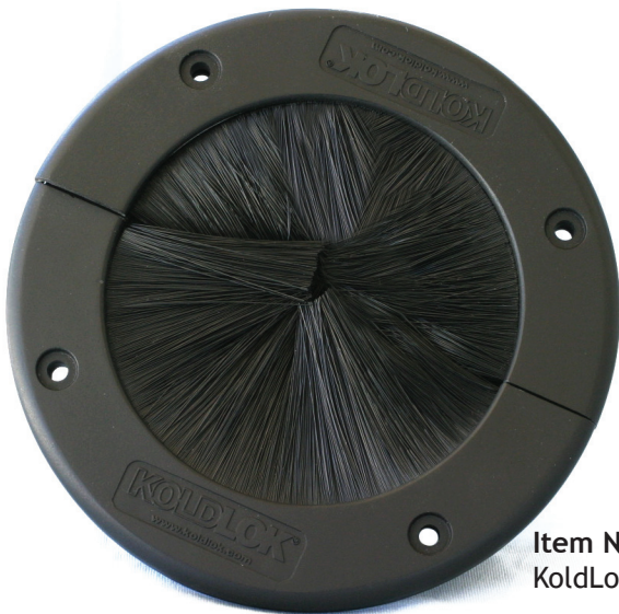
Item No.40001 KoldLok Round 4"